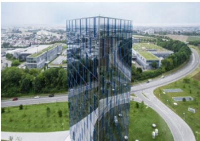
Title for image 1